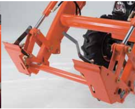
2-lever Quick Coupler